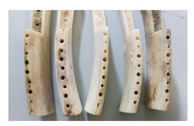
Figure 2. Ribs used for the evaluation of temperature changes (from top to bottom as position A, B, C, D, E, F, H)