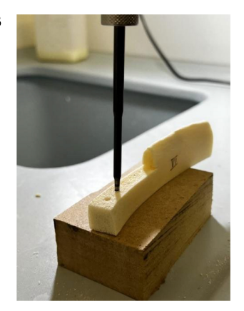
Figure 1. Preparation with drill (A) and mallet (B) on the part of the rib to be used for the study of the expansion (from top to bottom as position A, B, C, D)

The preparations were analyzed with the aid of an optical microscope (MZ6, Leica, Wetzlar, Germany) connected to a dedicated measurement software (Leica Map Start, Leica, Wetzlar, Germany) (error variance \pm 1 \mu m ).