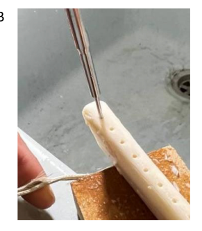
Figure 3. Thermocouple insertion and positioning. (A) Detail of the hole for inserting the thermocouple. (B) Position of the thermocouple during mallet preparation (from right to left as position A, B, C, D, E, F, H)

For the preparation with drills, the method indicated by the manufacturer was followed and then passages of the drills in sequence with increasing diameters: lanceolate drill to pass the thickness of the cortex and then preparation drills taken to the working size with diameters 2 mm, 2.5 mm, 2.8 mm and 3.3 mm.