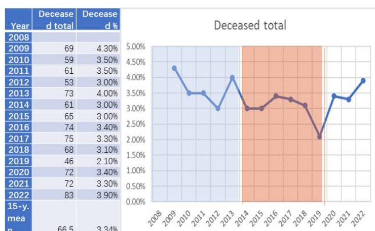
Figure S4. Deceased patients total (delisted from SOWL because of death)

For liver, the overall trend of the number of patients on the SOWL, irrespective HCV-status was an increase from 108 patients in the year 2008 to 207 patients in 2016 (+ 91.2%).