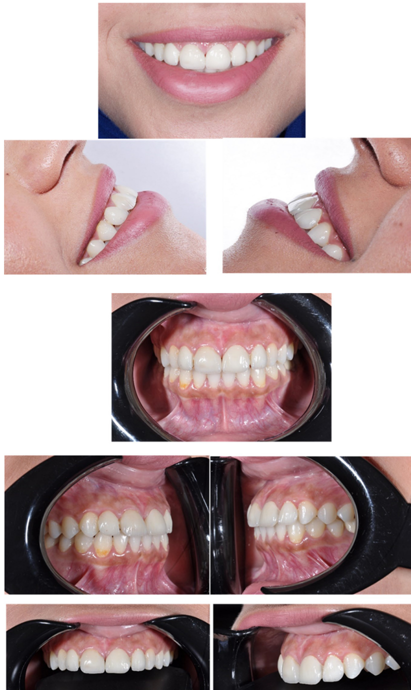
Figure 5. The photographs after the treatment