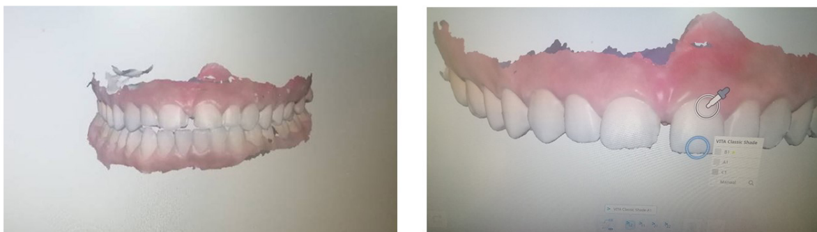
Figure 4. The scan after preparation and shade selection

Treating the veneer involves using 10% hydrofluoric acid to etch the inner surface for 20 seconds, followed by washing with water. Silane is then applied for a minute, followed by a layer of bond and cement, specifically a light-cured resin cement. Treating the abutments involves applying 37% phosphorous acid to the entire labial surface of the teeth for 30 seconds, followed by washing with water. A bonding material is then applied before carefully placing the veneers on the teeth, ensuring proper alignment. After light curing for two seconds, any excess material is removed before allowing sufficient time for curing. Each surface is cured for 40 seconds. Finally, it is recommended to take pre- and post-treatment photographs, both intraoral and extraoral, to document the results (Figure 5).